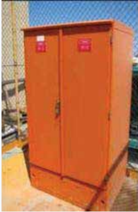
22kV HV RM6 ENCLOSURE