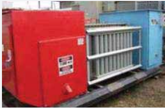
600kVA 11KV/1000/433V MINING SUBSTATION