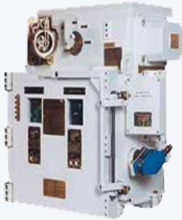
SW202/SLA MOTOR STARTER