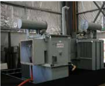
8/10MVA 22/11kV TRANSFORMER