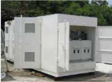
500kVA KIOSK SUBSTATION