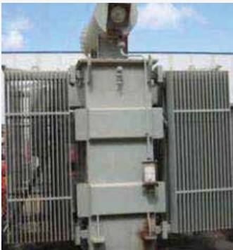
5000kVA 22/6.6 KV TRANSFORMER