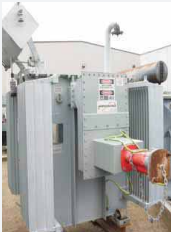
1500kVA 22/433V TRANSFORMER