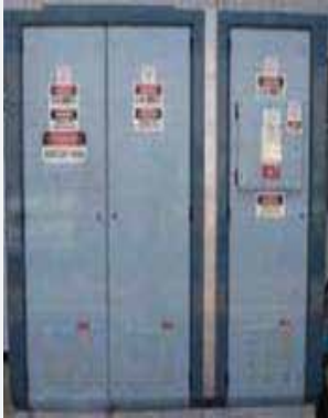
2MVAR POWER FACTOR CORRECTION UNIT AT 11000V