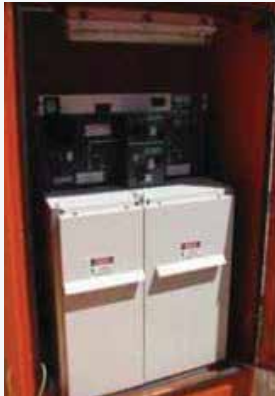
22kV HV RM6 ID CIRCUIT BREAKER