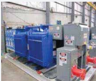
20000kVA 11000/1000V SUBSTATION