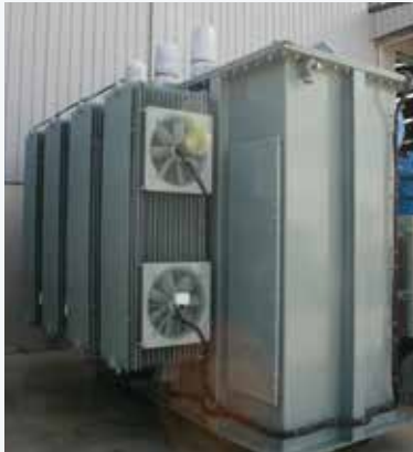
20 MVA 11kV/22kV TRANSFORMER